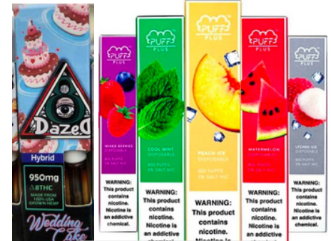
Images of Cake and Fruit Flavors