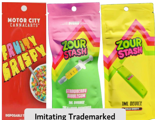
Imitating Trademarked Youth-Friendly Products