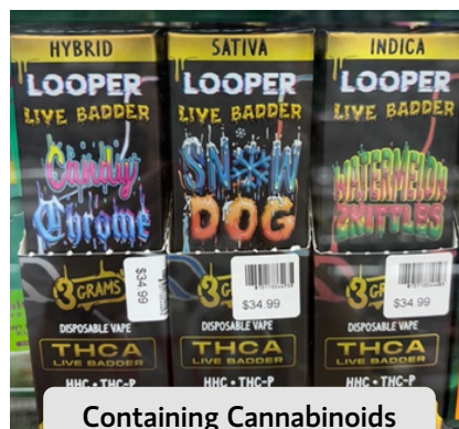
Containing Cannabinoids (e.g., THCA, Delta 8, Blends)